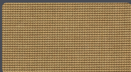
000 - gold